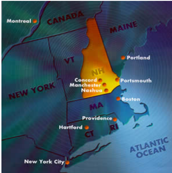
New Hampshire is centrally located in New England