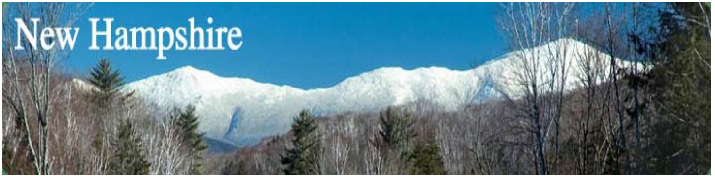
White Mountains National Forest, Bretton Woods, New Hampshire