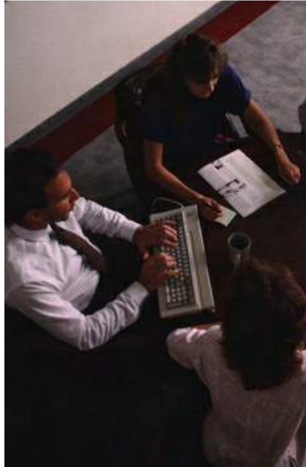
Planning, Journal of American Planning Association, 1962)