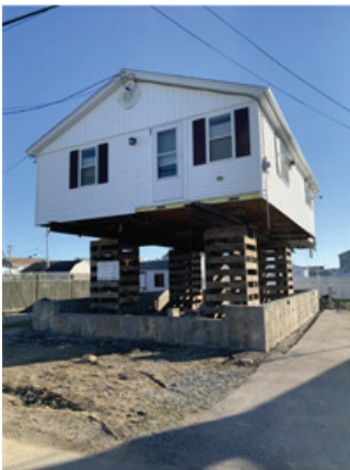
Hampton, NH 2021

The NH Coastal Program developed a local substantial improvement and substantial damage (SI/SD) management plan template as part of its recently completed Preparing for Resilient and Equitable Post-disaster And Recovery to Events (PREPARE) project . It can be used and customized by communities participating in the National Flood Insurance Program, which requires communities to make SI/SD determinations as part of their floodplain regulations.