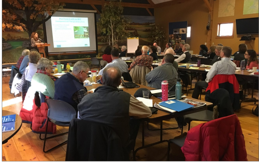
We had a great turnout at our NH Coastal Adaptation Workgroup-sponsored Floodplain Administrator 101 workshop at the Hugh Gregg Coastal Conservation Center in Greenland in December!

Free, online NFIP-related training is available through FEMA's contractor, STARR II. Many of the courses are eligible for CECs for Certified Floodplain Managers (CFMs). Be sure to check the website periodically as new webinars are always being added. To learn more about these webinars and to register, visit the <u>NFIP Training website</u> and click the "Upcoming" tab. When asked during registration what FEMA Region you are in, please reply "1". Upcoming webinars include: