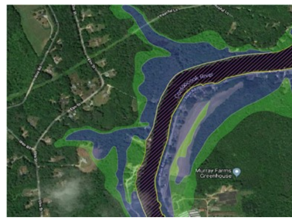
GIS data from FEMA flood maps is available for all NH communities except those in Belknap County.

which shapefiles contain which information. (The more useful ones include S_FLD_HAZ_AR.shp, S_BFE.shp, S_XS.shp, and S_POL_AR.shp.)