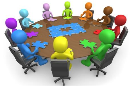
Allenstown Master Plan 2016

ALLENSTOWN TODAY: ALLENSTOWN MASTER PLAN | 1