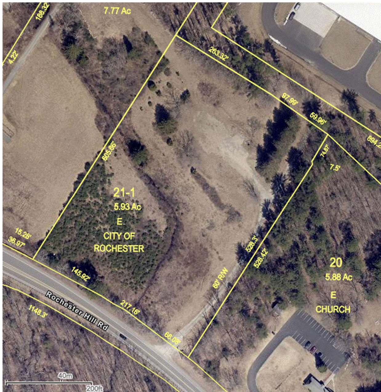
Site of Future Rochester Courthouse 296 Rochester Hill Road Rochester, New Hampshire City of Rochester GIS Aerial Imagery Map (host parcel shown as Lot 21-1 at center above)