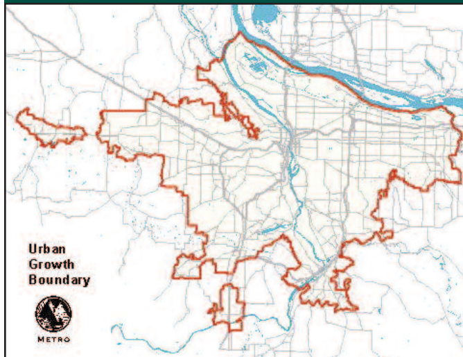
FIGURE 1.8.1 Urban Growth Boundaries

Urban Growth Boundary for Portland, Oregon (on-line resources at www.portlandonline.com/planning ).