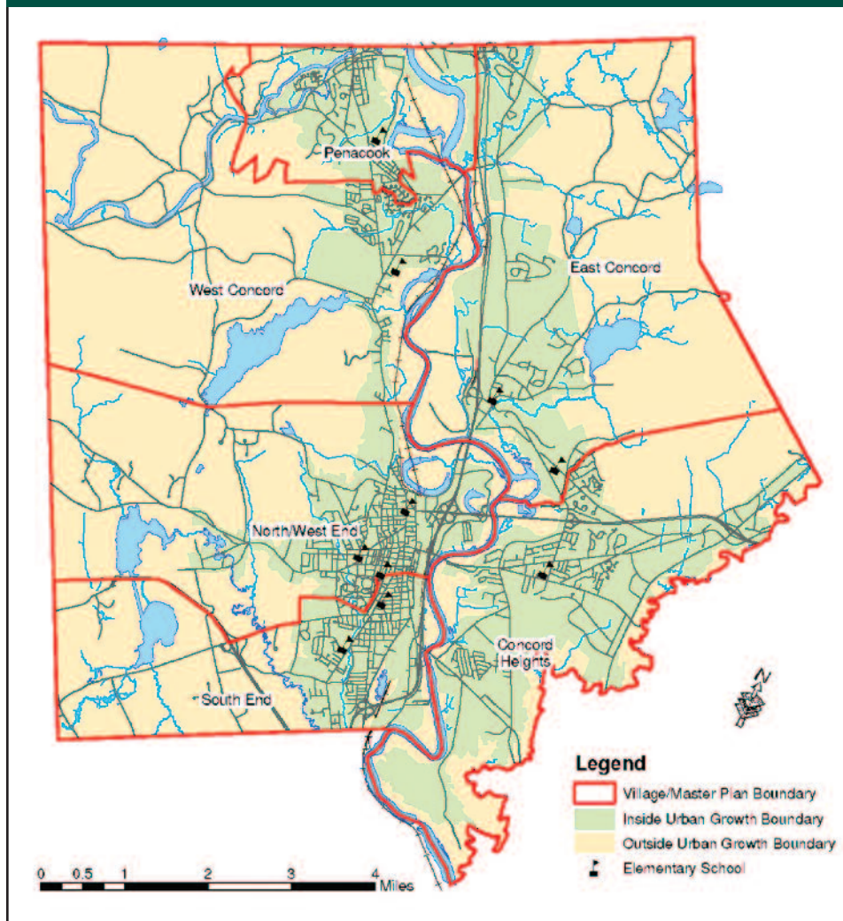
FIGURE 1.8.2 Concord Village/Master Plan Districts

and the urban growth boundary may be further refined. (See Figure 1.8.2 for City of Concord Master Plan Map).